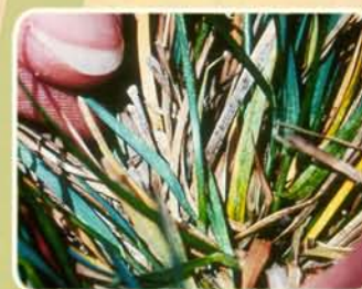
Typical symptoms of a mite infested lawn. Notice the start of discoloration.

That dead-looking, tan lawn you see in winter is often blamed on the harsh season. But that is not always the case. Damage you see in early spring may be a result of winter-feeding mites. When first infested, the grass blades will show small yellow speckles. As the damage increases, the grass becomes tan in color and eventually dies. With the cover of snow, homeowners usually don't think about their lawn, but that does not stop the mites' from gnawing into the grass blades and draining the juicy nutrients. You'll most likely notice dead patches appear as winter thaws.