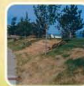
Example of severe mite damage.

Informational resources courtesy of Curtis E. Swift, Ph.D., Area Extension Agent (Horticulture), Colorado State University Extension, Tri River Area.