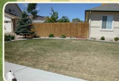
Example of a mite-damaged lawn.

Winter-feeding Mites love your fall turf.